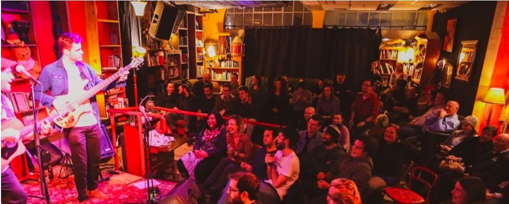
A band plays on the stage at Smith's Alternative.

A bookshop for its first three decades, Smith's Alternative is now one of the most popular venues for live music in Canberra and a drink after dark. When the sun is up, it's a café and art gallery. The vibe is cosy and a bit bohemian, with seating and a stage nestled between walls covered with bookshelves and art. Grab a coffee or T2 tea for an afternoon catch-up between classes. Or come in the evening for a beverage and a show. There's something on most nights of the week, with performances ranging from music (of all genres) to cabaret, and from burlesque to poetry and stand-up comedy.