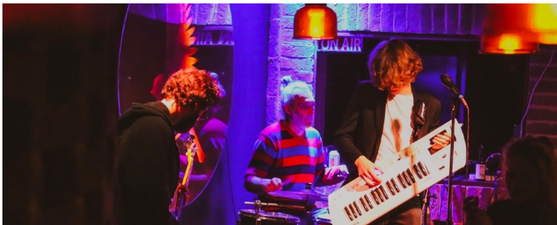
The band "The Prettiranas" play live at Blackbird Bar.

Sitting snugly upstairs in the Sydney Building, Sideway is an intimate music bar and home to some of the best live music in Canberra. Grab a cocktail or local beer and sit back to enjoy music from local and visiting performers. With a relaxed, warm and inclusive vibe, Sideway also regularly hosts a range of comedy acts and open-mic nights to keep things interesting.