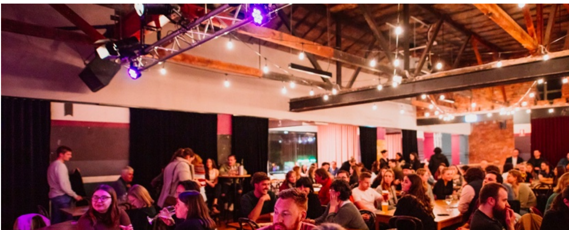
People enjoy a meal and comedy at Verity Lane Market.

Want live music every Friday night? Then wander no further than the Verity Lane Market in the iconic, heritage-listed Sydney Building in Civic. Specialising in a range of beverages and street food vendor-style dining options for all tastes, this is the perfect casual yet elegant spot from which to launch yourself into the weekend. Keep an eye out for events like Trivia Tuesdays, Politics in the Pub and the theatre and comedy performances that pop up at this venue too from time to time.