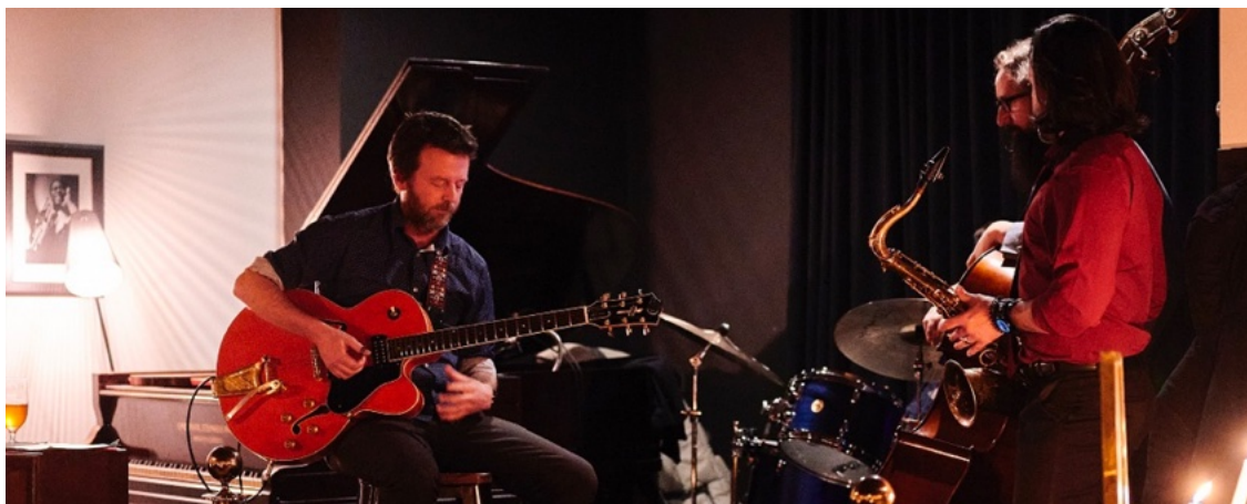
Jazz bands take to the stage every Tuesday at Molly's.

lovers. Over a selection of drinks, listen to music that will take you back to the 1920s and the streets of New York and New Orleans.